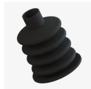
Gaiters & Bellows