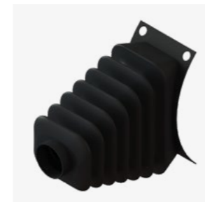
Custom & Bespoke Components